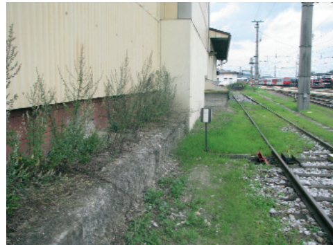
Fig. 2: Habitat of Podarcis muralis at the railway station of Steindorf bei Straßwalchen (Salzburg, Austria).

men from Steindorf shows a haplotype different to all other investigated samples from the region of the respective haploclade. Based on the red underside of the individu-