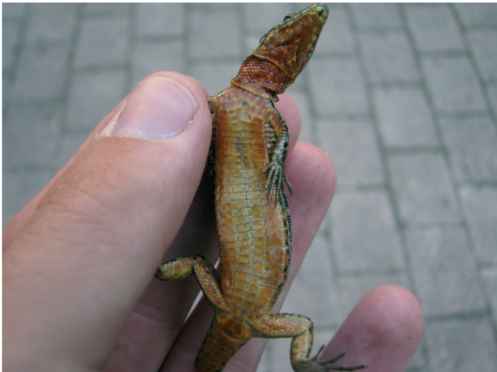
Fig. 3: Ventral side of the Podarcis muralis specimen sampled at the railway station of "Steindorf bei Straßwalchen" (Salzburg, Austria). The individual was released after sampling.

als (Fig. 3), and the features of the haplotype detected, we hypothesize that this allochthonous population originates from the region of the Lake Maggiore, or the Lake